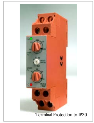
Dims: to DIN 43880 W. 17.5mm