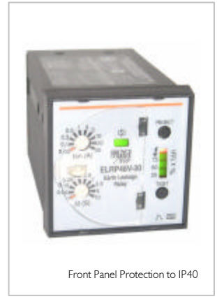
Front Panel Protection to IP40