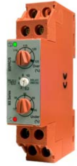
Terminal Protection to IP20